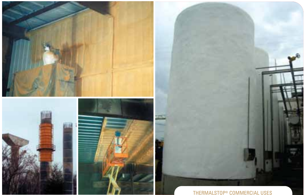
THERMALSTOP® COMMERCIAL USES