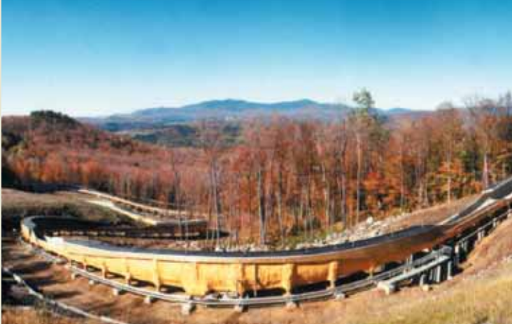
THERMALSTOP® INSULATES THE LAKE PLACID BOBSLED RUN.