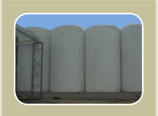
TANK INSULATED BY THERMALSTOP®