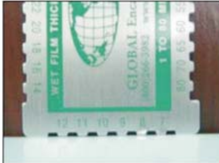
Wet Mil Gauge in Coating

Insert numbered tooth required into freshly applied wet coating system. The gauge will show the wet mil thickness on the substrate Refer to the illustrations below: