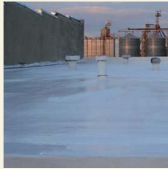
2. Prime surface with Tack Coat™ primer.