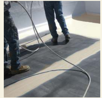
4. Seal entire roof with Rapid Roof III top coat.

*See Product Specifications for current pull-test requirements.