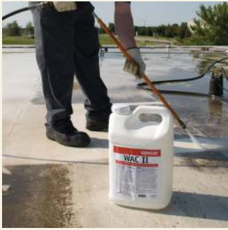
1. Power wash and clean with WAC II® roof cleaner